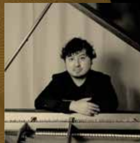
Fumiyasu Kawase PIANIST